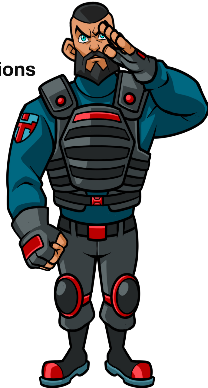
Maximus "Max" Hodl