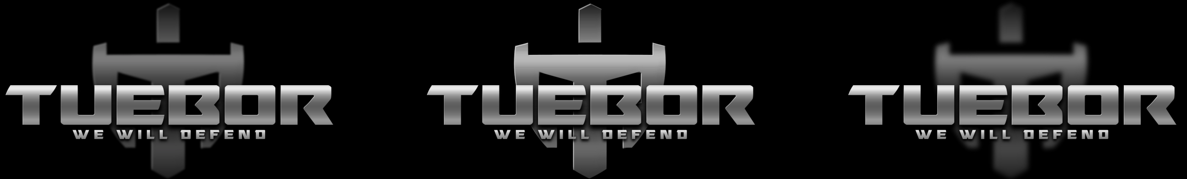
Alternate Lockups with new Tuebor typeface