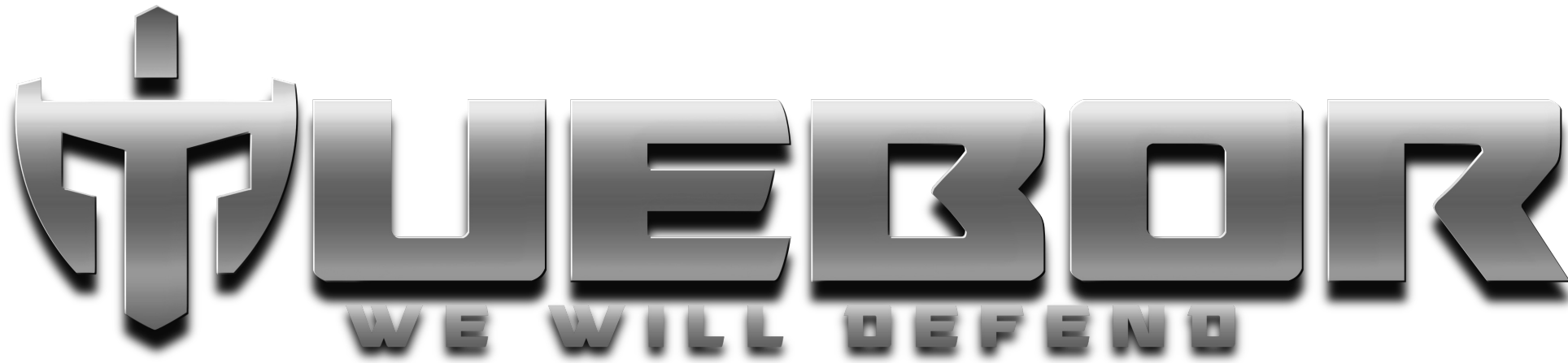
Logo Lockup with Shield