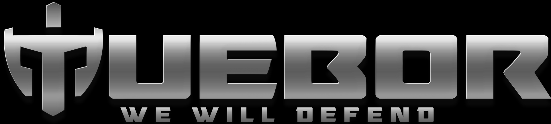
New Logo Lockup and Shield Shape